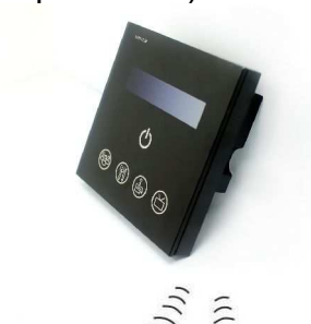
WIFI touch dimmer (output 0-10V)