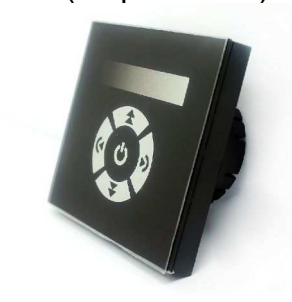
European standard touch dimmer (output 0-10V)